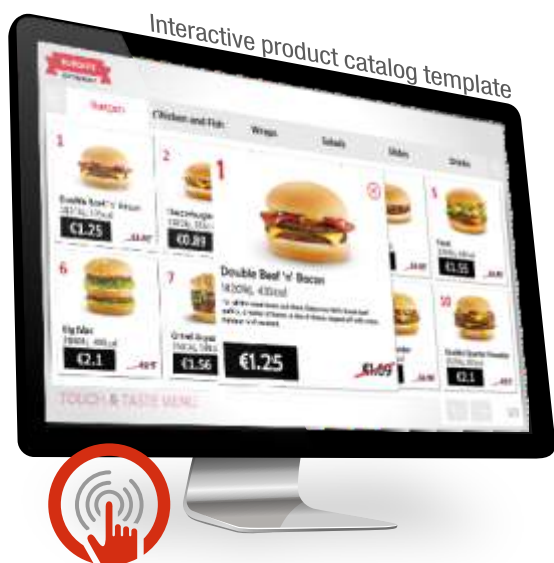
Interactive product catalog template

Use one or a combination of templates to customize your screens based on your promotional needs. Display your products and your product bundles in a series of slides or one by one maximizing your sales by reaching the critical mass, also ensuring price accuracy via database driven templates.