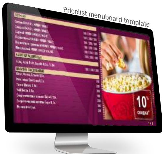
Pricelist menuboard template

Display your products in an organized way ensuring accurate product prices made possible through database driven templates. Each product could be followed by a static image, animation or even a video.